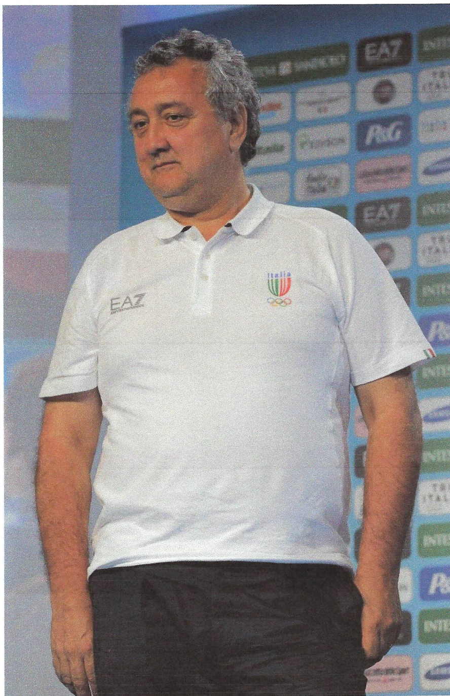
Paolo Barelli has led the LEN since 2012 and is seeking a second term in office

Barelli, a former Olympic swimmer who competed at Munich 1972 and Montreal 1976 and won a 4x100 metres freestyle relay bronze medal at the 1975 World Championships in Cali, was elected President in 2012 after Luxembourg's Nory Kruchten relinquished the role.